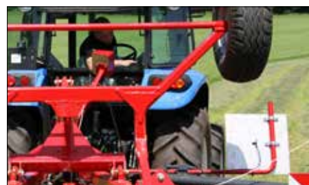
From the cabin it is easy to see the working position