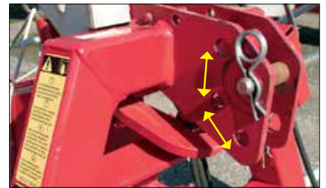
Articulated headstock ensures perfect ground following