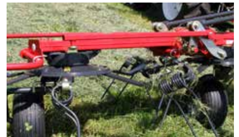
Square boom frame for intensive use and closed drive line