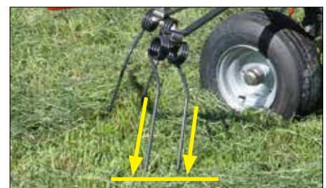
Asymmetric double tines