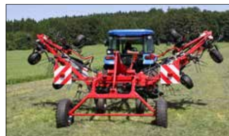
Z 8805 T in folding position