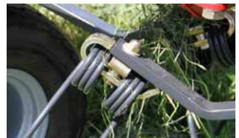
Tine safety lock