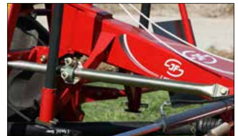
Stabilizer ensures smooth operation