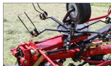
Z 8805 T folded