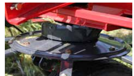
Closed gear box, ensures minimum maintenance requirement