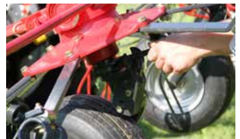
Field boundary clearing