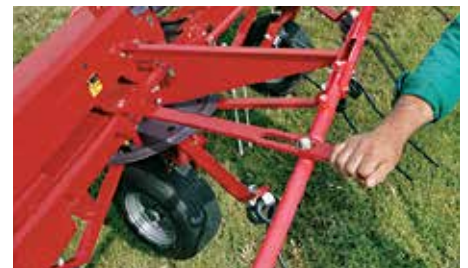
Field boundary clearing with Pro-series