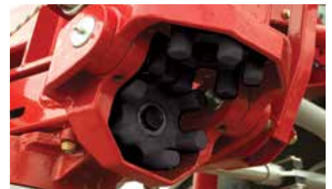
Finger Link transfers the power between the rotor units